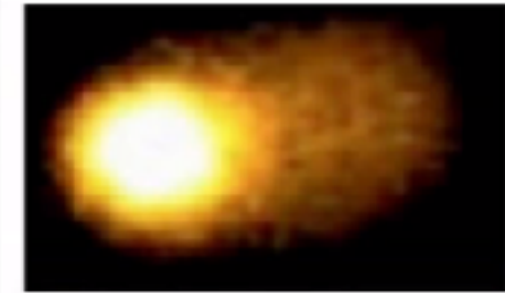
Non-ionising RF-EMF exposure 24 hours mobile phone exposure 1,800 MHz at SAR = 1.3W/kg

Comet Assays, aka single-cell gel electrophoresis, of DNA: control and after exposures