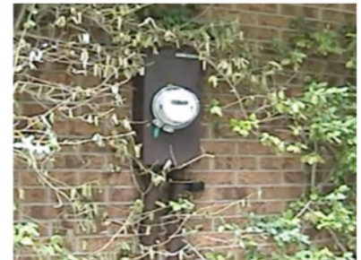
safe analog meter