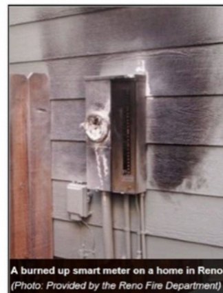
A burned up smart meter on a home in Reno.