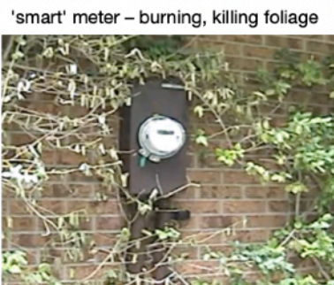
'smart' meter – burning, killing foliage