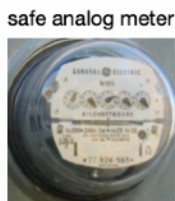
safe analog meter

What kind of electricity meter do you currently have? It is usually outside near the driveway.